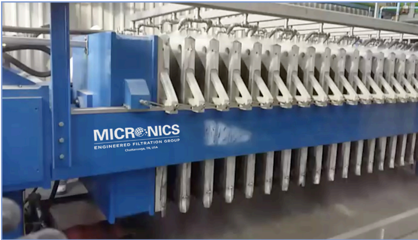
Linked Filter Plates