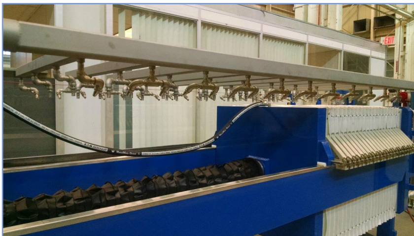
Flood Cloth Wash Header