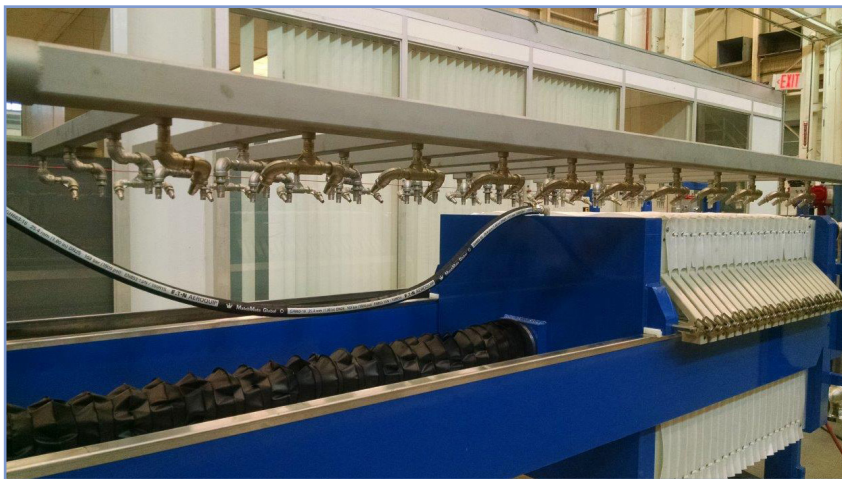
Flood Cloth Wash Header