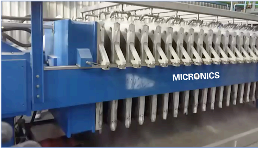
Linked Filter Plates